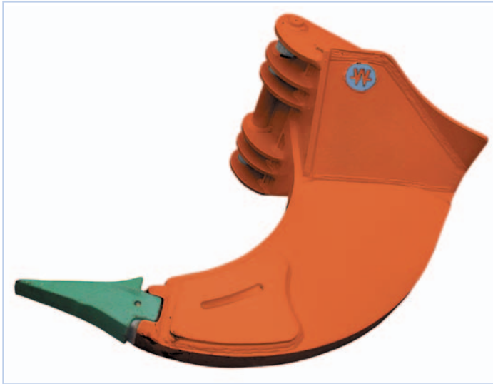
Rock ripper XHD for hard application, made from WHD 450 special wear steel, with Esco ripper-tooth