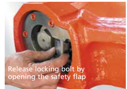
Release locking bolt by opening the safety flap