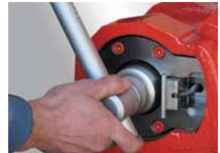
Open with 1 1/2 rotations