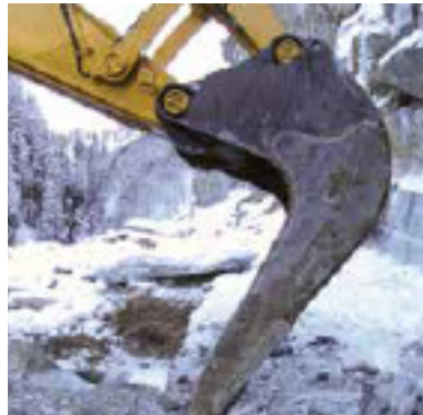
ST model with special shape