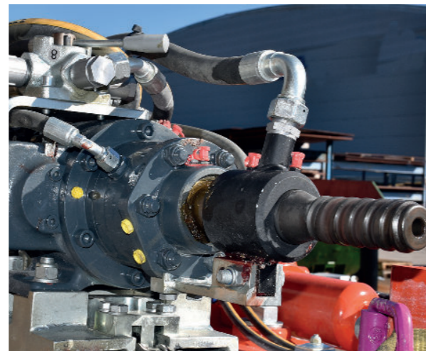
Eurodrill WHD 1002 Hammer