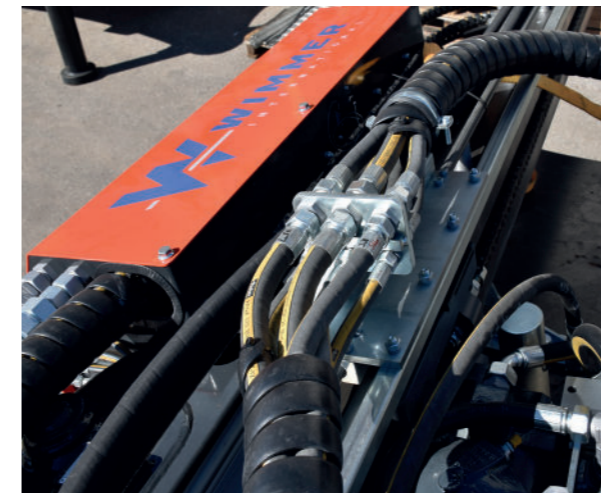
Functional hose guide