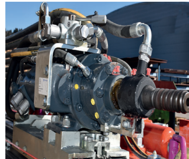
Eurodrill WHD 1002 hammer