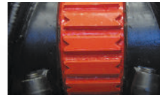
Hardox gear protection

The robust housing protects against damage to the hydraulic motor or to the cables